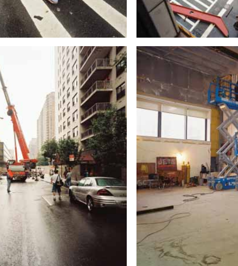
Clockwise from top left The 44-foot long, W36x328 beams were delivered on site by truck, then crane lifted and inserted through a window in the building.