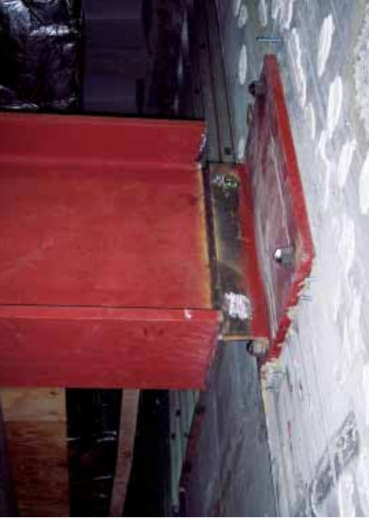
Top On the north side, the beams attach to a 36x8x1.25 HSS that transfers loads to the building's columns. Bottom On the south side, the beams attach to imbeds in a shear wall.